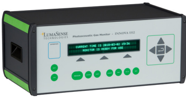
INNOVA 1512 Photoacoustic Gas Monitor.