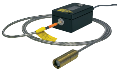
IMPAC IS 50-LO Plus