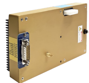
Fig. 2. UltraVolt® High Power C series 2C24-P250